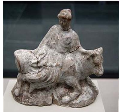
Terracotta figurine from Athens, ca. 480-460 BC

And on her forehead a name was written: MYSTERY, BABYLON THE GREAT, THE MOTHER OF HARLOTS AND OF THE ABOMINATIONS OF THE EARTH. I saw the woman, drunk with the blood of the saints and with the blood of the martyrs of Jesus. And when I saw her, I marveled with great amazement. But the angel said to me, “Why did you marvel? I will tell you the mystery of the woman and of the beast that carries her , which has the seven heads and the ten horns.” (Revelation 17:5 NKJV)