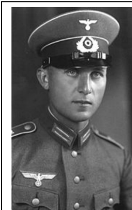
Paul Dickopf in German Army Uniform. Interpol President in the early 1970s.

It is well to know who these people are, and where they've been. Though the expression "modern day SS" sounds like a hyperbolic metaphor, an examination of Interpol's roots shows that it is, in fact, more literally true than that.