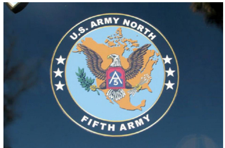
Army shoulder patch of North American continent in U.N. colors